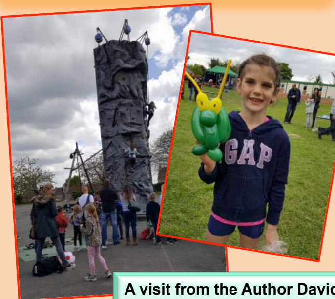
A visit from the Author David Solomons. Supported by FOCCS!

Arts Week - supported by FOCCS: more photos are on the school website Look out for displays in empty shop windows around town!